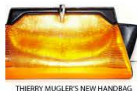
THIERRY MUGLER'S NEW HANDBAG COLLECTION FOR S/S 2013