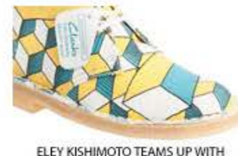
ELEY KISHIMOTO TEAMS UP WITH CLARKS TO MARK 20TH ANNIVERSARY