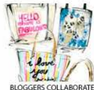
BLOGGERS COLLABORATE WITH RIVER ISLAND